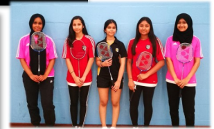
Team of the Year K54 Badminton Team

An AMAZING 8 wins so far this year in Table Tennis and Netball :)